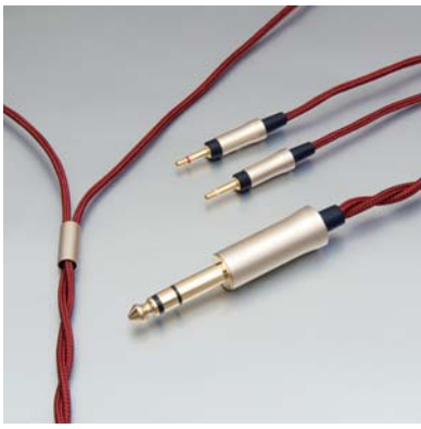
hpct_03_ub62_300 6.3 stereo plug - 2.5 mono plug(l/r) 6n + 4n hybrid 4 core twisted polyester yarn braided jacket length:3.0m jan:4534165012869