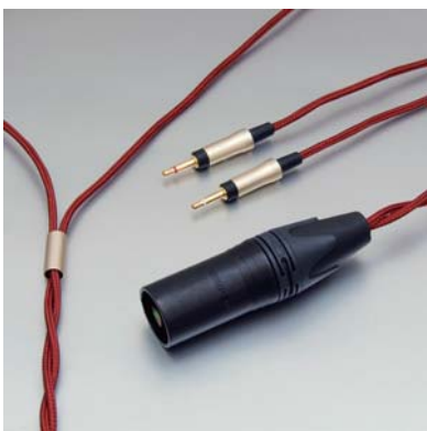
hpct_03_blx2_300 4pin xlr plug - 2.5 mono plug(l/r) 6n + 4n hybrid 4 core twisted polyester yarn braided jacket length:3.0m jan:4534165012890