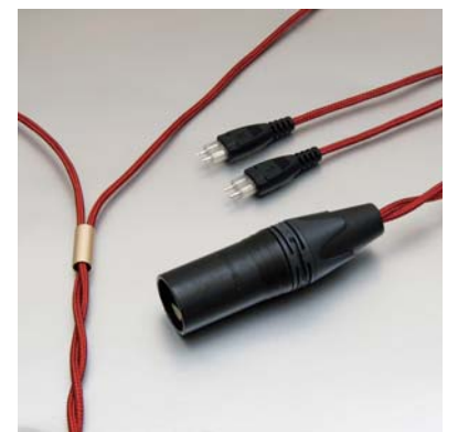
hpct_03_blxp_300 4pin xlr plug - 2pin (l/r) 6n + 4n hybrid 4 core twisted polyester yarn braided jacket length:3.0m jan:4534165012913