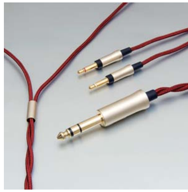
hpct_03_ub63_300 6.3 stereo plug - 3.5 mono plug(l/r) 6n + 4n hybrid 4 core twisted polyester yarn braided jacket length:3.0m jan:4534165012876