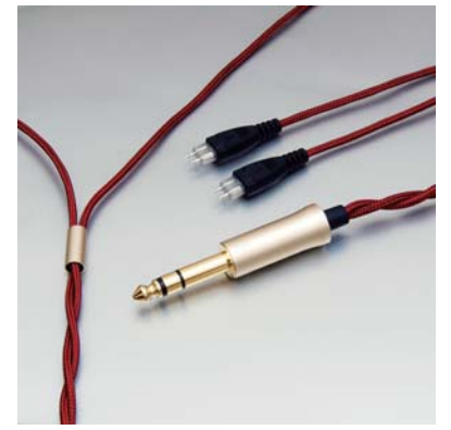
hpct_03_ub6p_300 6.3 stereo plug - 2pin (l/r) 6n + 4n hybrid 4 core twisted polyester yarn braided jacket length:3.0m jan:4534165012883