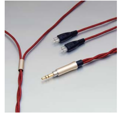
hpct_03_ub3p_120 3.5 stereo plug - 2pin (l/r) 6n + 4n hybrid 4 core twisted polyester yarn braided jacket length:1.2m jan:4534165012852