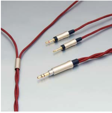
hpct_03_ub32_120 3.5 stereo plug - 2.5 mono plug(l/r) 6n + 4n hybrid 4 core twisted polyester yarn braided jacket length:1.2m jan:4534165012838

6N(99.9999% pure copper) + 4N(99.99% pure copper) hybrid conductor 4 core twisted.