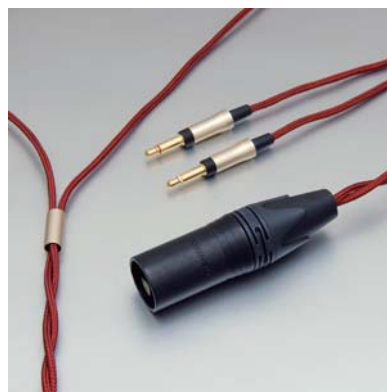
hpct_03_blx3_300 4pin xlr plug - 3.5 mono plug(l/r) 6n + 4n hybrid 4 core twisted polyester yarn braided jacket length:3.0m jan:4534165012906