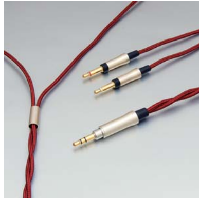
hpct_03_ub33_120 3.5 stereo plug - 3.5 mono plug(l/r) 6n + 4n hybrid 4 core twisted polyester yarn braided jacket length:1.2m jan:4534165012845